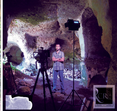
Figure 1.- Photographic views of the cave at Fornello, north-south axis; credits: ©Filip A. Petcu.

If compared to the majority of cave churches in Apulia excavated in soft limestone, the particularity of the geological structure of Fornello is revealed in a vertical structure of the wall appearance and shows a superimposition of three distinctive layers. [illustration 1] The sedimentary calcarenite , on top is separated from the underlying layer of limestone at the bottom by an intermediate thin layer of scattered angular stones of medium size, which are spread almost regularly over the bottom limestone bedrock.