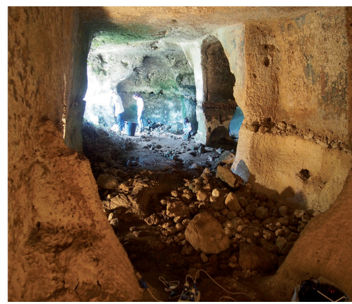
Figure 2. - Photographic details from preliminary observational studies on-site and during the first cleaning of the cave floor; credits: ©Filip A. Petcu.

of the crypt's space and minor cleaning tests carried on several areas with prominent salt crystallizations and surface efflorescence [illustration 2]. An updated plan of the cave has been drawn and the existent painted scenes have been partially decrypted and assigned to the plan. The sequence of the fresco layers was preliminary studied in order to develop a mapping process, and a subsequent understanding of the preserved pictures. One Greek inscription has been identified in the original layer, while other six Latin inscriptions have been traced and partially deciphered in more recent layers, revealing additional information on donors and the painted scenes. The floor has been cleaned on the very surface, gathering a large quantity of stone blocks scattered all over the crypt's floor. These have been carefully piled in a side-niche, outside of the perimeter of the painted area of the crypt. The aim was to reuse them in a sustainable way for any necessary consolidation works at walls and the entrance. A large quantity of soot and soil has been gradually removed from the floor surface, when a potential cistern became apparent, as well as stairs at the original entrance of the cave. Several loculi, carved rectangular recessions, with sepulchral value, excavated in the bedrock of the cave floor.