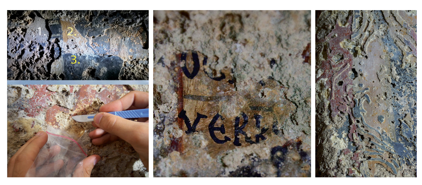
Figure 3.- Photographic details showing the degraded superimposed layers of plaster and the massive crystallization of salts on the painted surface of the wallpaintings; credits: ©Filip A. Petcu.

the substrate by picking it in order to improve the grip of a new plaster layer.